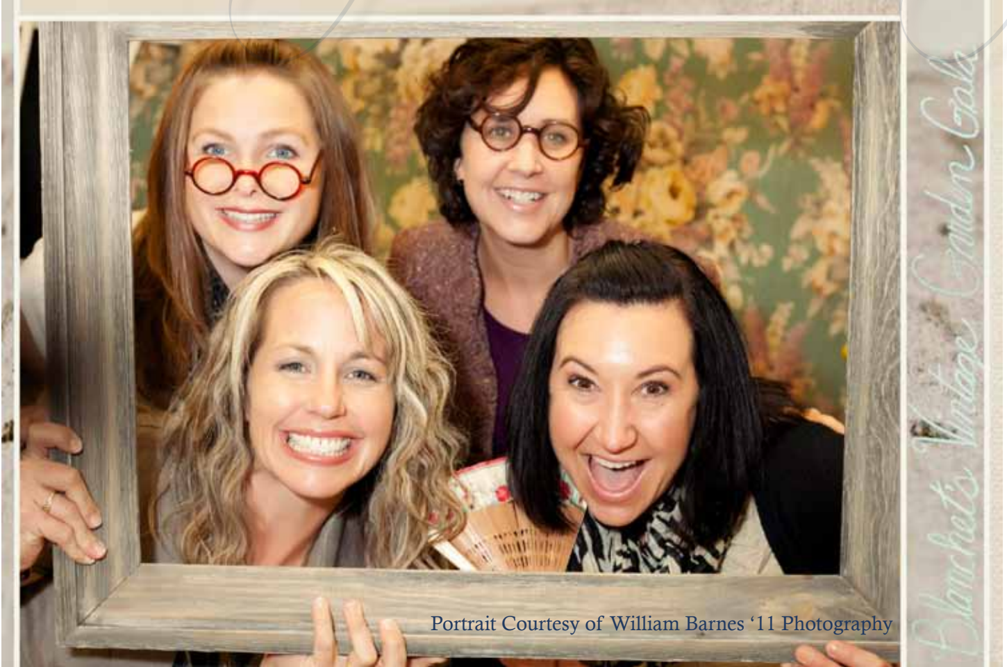
Portrait Courtesy of William Barnes '11 Photography

Thank you to all who attended, volunteered and supported our annual auction, "A Vintage Garden Gala" on October 13, 2012. The auction is an important Blanchet tradition that brings together families, friends, students, alumni, teachers and many others in support of the only Catholic secondary school in Salem. Proceeds are applied to the school's operating budget and directly benefit students and programs.