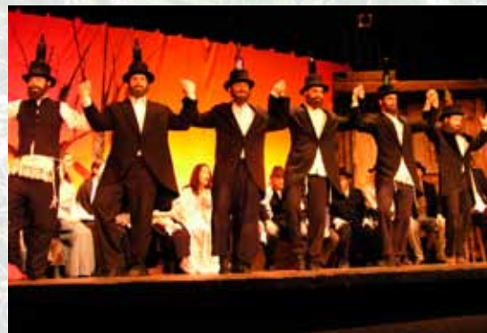
The spring musical, "Fiddler on the Roof," features sold out performances.