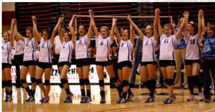
The varsity volleyball team wins the first ever OSAA State Team Championship.

Blanchet is selected as "Best Private School" and "Best High School" in the Statesman Journal's Best of the Mid Valley Contest.