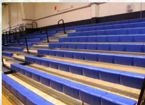
New bleachers are installed in the Main Gym.

The computer lab is updated, exterior doors and drinking fountains are replaced, mid high restrooms are remodeled. A new web site is launched with the capability for parents to check grades and attendance online and to receive updates via text or email. New laptops are purchased for teachers.