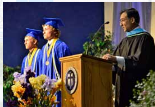
The 65 members of the class of 2011 are offered $3.2 million in scholarship funds.