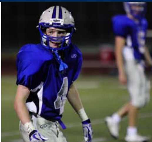
Varsity football advanced to the quarterfinals of state play-offs.