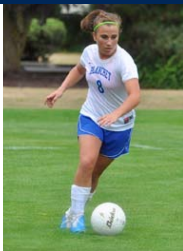
Girls varsity soccer advanced to the quarterfinals of state play-offs.