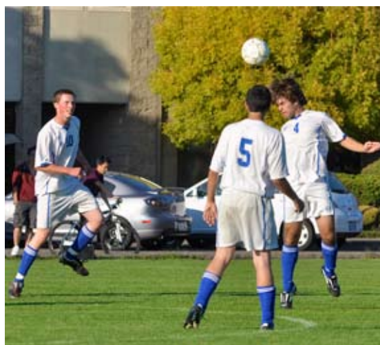
Boys varsity soccer wins the 2010 District 4 Sportsmanship Award.