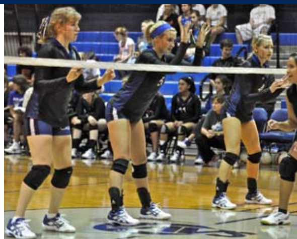
Varsity volleyball advanced to the 1st round of state play-offs.