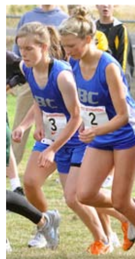
Girls cross country finished in 11th place at the state meet.